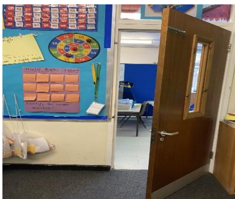
Door to corridor