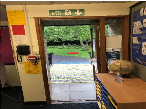
Door to playground