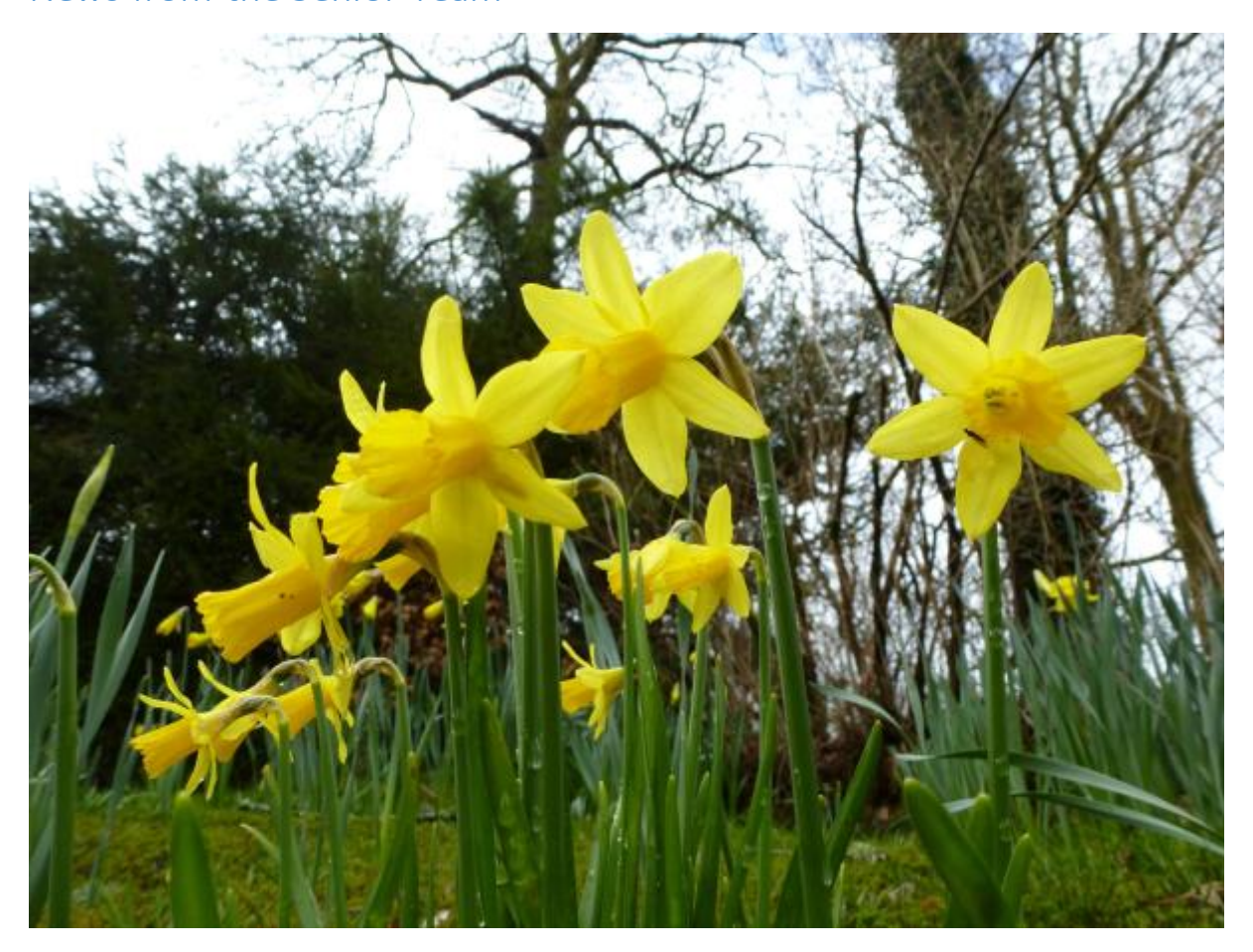
Dear Parents and Carers

Lots to cheer and celebrate this week at Staplehurst!