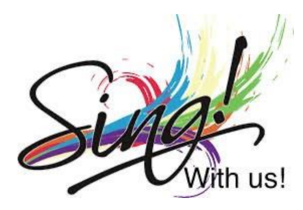
1 - All welcome, but especially choir members and families.