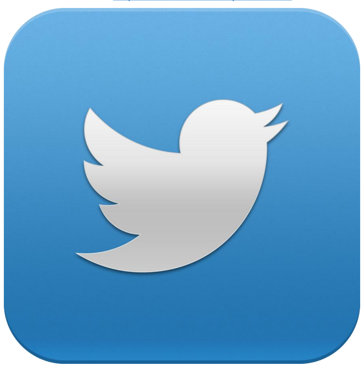
Follow us on Twitter <a href="https://twitter.com/StaplehurstSch">https://twitter.com/StaplehurstSch</a>